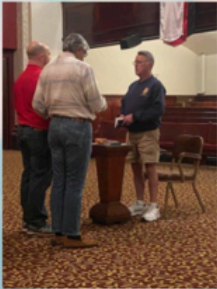
Learning the ways of the Senior Warden