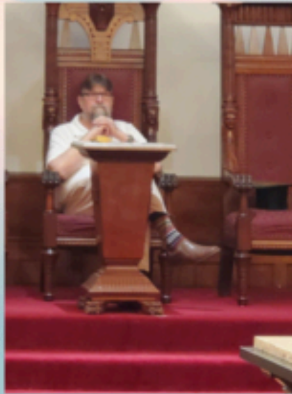
Past Grand Master helping with students learn the ritual