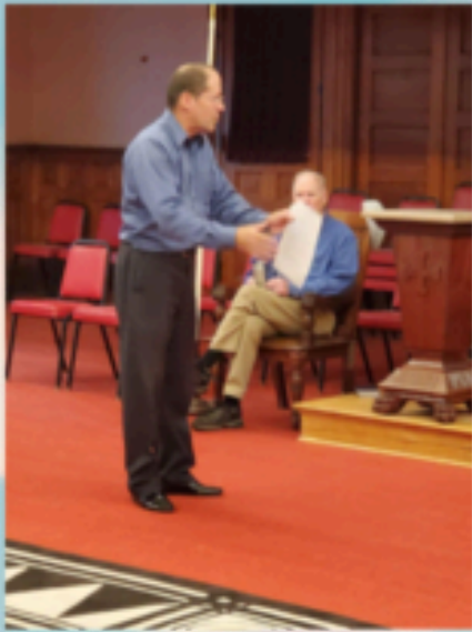
The Grandmaster giving instructions