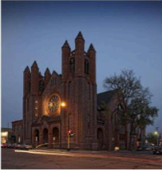
Minneapolis Scottish Rite Temple 2011 Dupont Ave S, Minneapolis, MN 55405